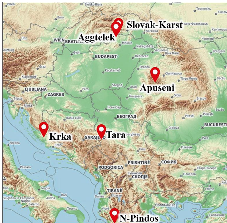
Figure 2. Studied national (nature) parks. Base map: https://opentopomap.org

The analysis using the first method described above was carried out in a European context. The other methods were applied to selected national (or nature) parks at the following locations: Aggtelek National Park (Hungary), Slovak-Karst National Park (Slovakia), Krka National Park (Croatia), Tara National Park (Serbia), Apuseni Nature Park (Romania) and, not completely, but certain analyses were also carried out in relation to the Northern Pindos National Park (Greece). The locations are shown in Figure 2.